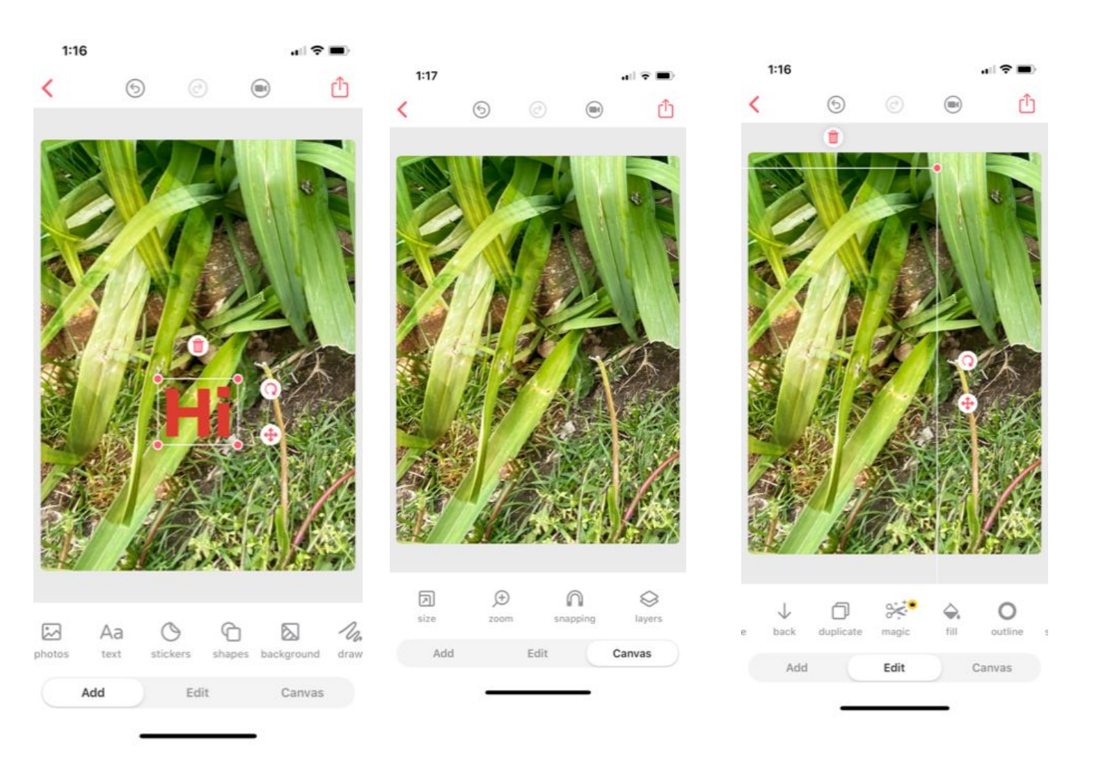
Task #2 : Combine all 4-5 of your selected images in the app to form a composition. You may use any app or software, Bazaart was just a new option.